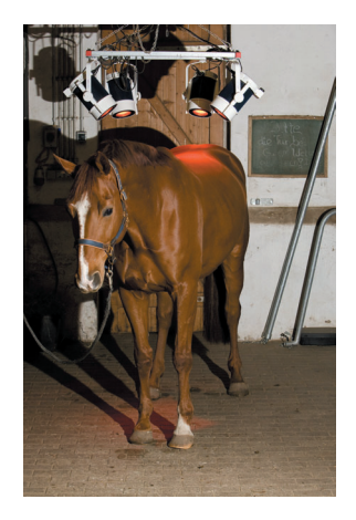
Irradiation treatment using the hydrosun®-irradiator ceiling device