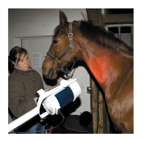
13 year old Westphalian mare, irradiation of pectoral muscles