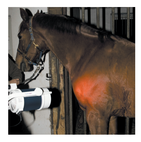
Irradiation of shoulder