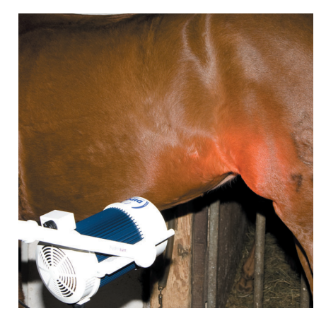
Irradiation of thigh