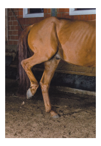
7-year old Hanoverian gelding, dressage horse, with pronounced steppage gait